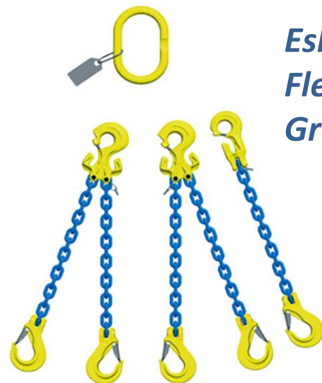
Eslinga Flexileg GrabiQ