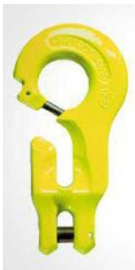
Conector CG GrabiQ