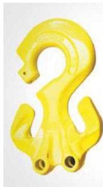
Conector CGD GrabiQ